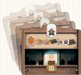
32 Department tiles (2 each of 16 different Departments)