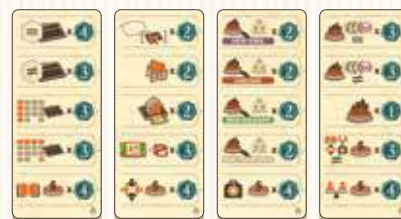
4 Donation tiles