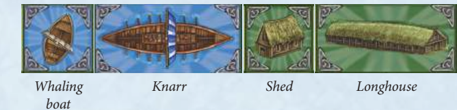
Whaling boat Knarr Shed Longhouse

With the new exploration boards you can gain new bonuses, including the new goods from this expansion and: