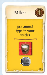
Card 10 A: This card also applies to pigs and horses.

Due to the new goods and action spaces, some of the occupation cards require clarification, and four of the 190 can now no longer be played in certain situations. For all occupation cards, the picture and text on the card itself is the most important information, even if the description in the appendix doesn’t mention the new goods tiles and action spaces.