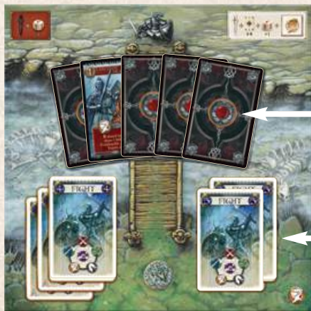
The Quest ends with a 5 th Black card