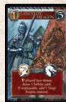
Lancelot & Dragon