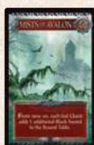
Mist of Avalon