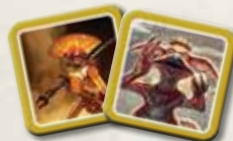
2 Companion Tokens