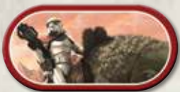
6 Ally and Villain Tokens