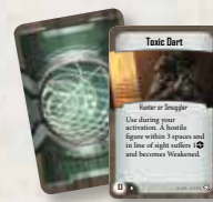
10 Command Cards