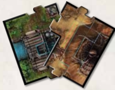
18 Map Tiles