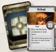
3 Supply Cards