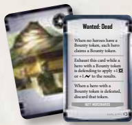
19 Imperial Class Cards (2 decks)