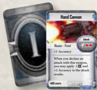
9 Item Cards (3 decks, 3 in each)