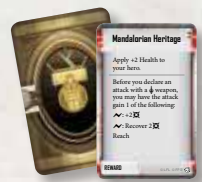
4 Reward Cards