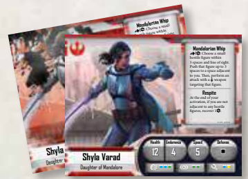
3 Hero Sheets