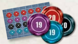
8 ID Tokens with 24 ID Stickers