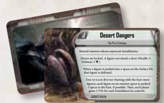
4 Skirmish Mission Cards