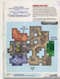
1 Skirmish Map Sheet