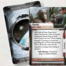
4 Side Mission Cards