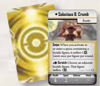
2 Companion Cards