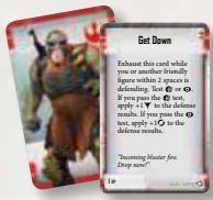
27 Hero Class Cards (3 decks, 9 in each)