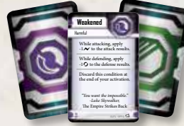
8 Condition Cards