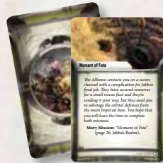
11 Story Mission Cards