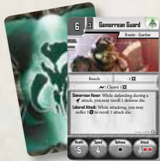
20 Deployment Cards (3 decks)