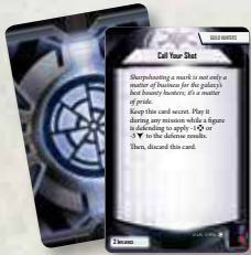
6 Agenda Cards