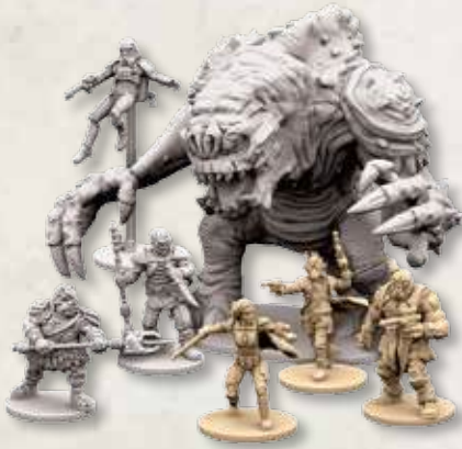
16 Plastic Figures (and 8 plastic pegs)