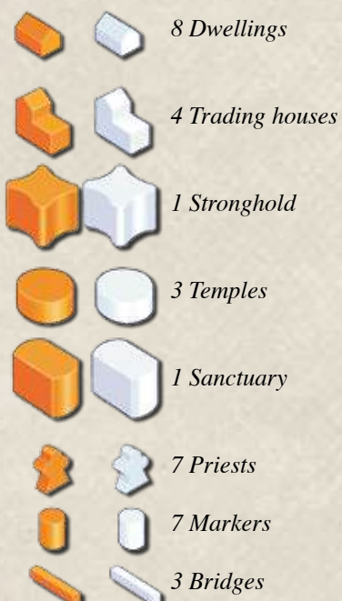
per faction color (white, orange):