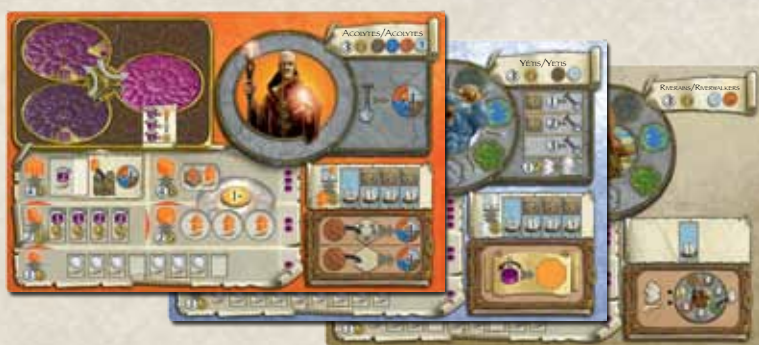
3 double-sided Faction boards (each side displays a different faction)