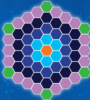
SIX-PLAYER (LARGE GALAXY)