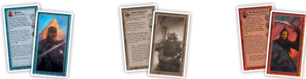
Free Peoples (5) Awakened Sovereign cards