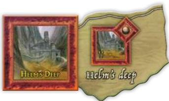
Helm's Deep Shadow Stronghold tiles