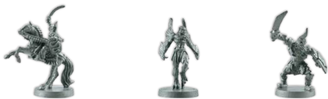
The Black Serpent The Shadow of Mirkwood Uglúk