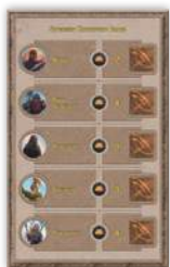
Sovereign Corruption board