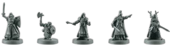
Brand Dáin Denethor Théoden Thranduil